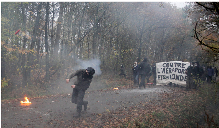
A zadiste throws back a police tear gas canister, 23 November 2012