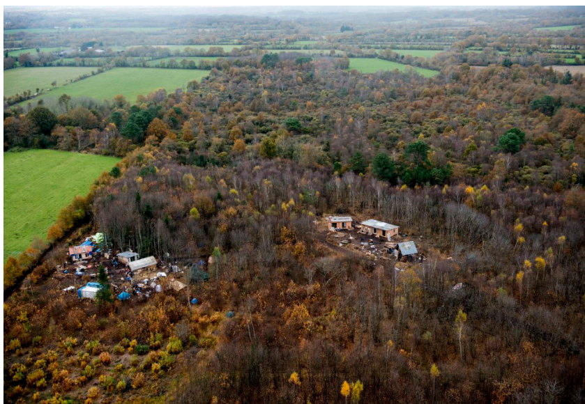
Squats in Rohanne forest