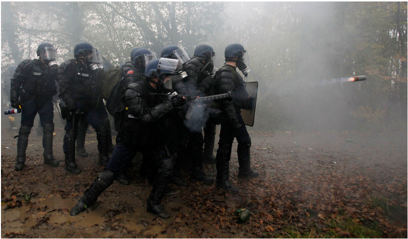
Mobile gendarmes attack opponents in the forest, 23 November 2012

So, from time to time it’s worthwhile to say it again: we are in the process of winning, and on the other side they must be pretty bothered! Besides, one only has to read their pitiful declarations, exhorting good citizens to let the politicians think in their place, desperately waving the red flag of the ultra-left/anarcho-autonomous/whatever-frightens menace, trying again and always to divide opponents with calls to reason, coloring themselves regularly