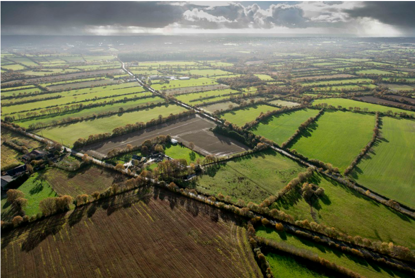
An aerial view of the ZAD