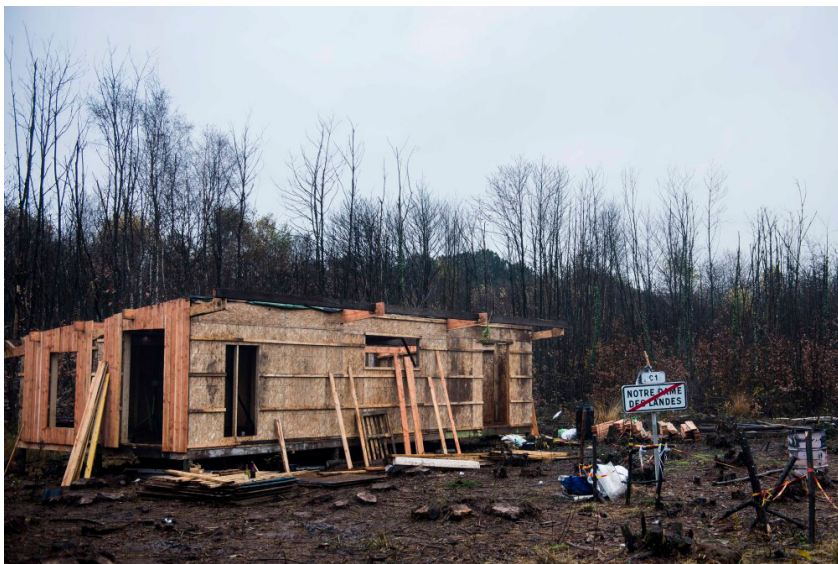
A building under construction by Rohanne forest, 18 November 2012

Over here the struggle continues in the days to come: this weekend and next week to continue the reconstruction on the land occupied today, in Rohanne forest and elsewhere; next weekend for the monthly demonstration against the airport and its world in Nantes Saturday the 24th; and in the months to come to prevent the destruction of Rohanne forest and the first works on the roadblock planned in the months to come – rendezvous details will be transmitted on the website zad.nadir.org .