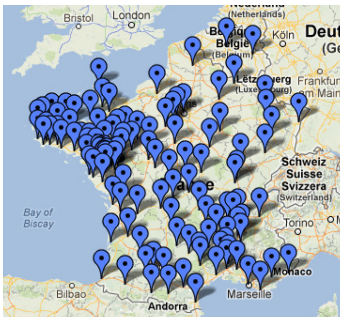
A map of ZAD support committees across France